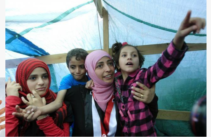
Tevekkül Kerman Nobel Peace Prize - 2011