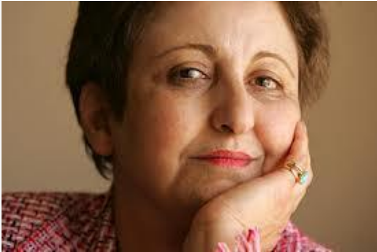
Shirin Ebadi Nobel Peace Prize - 2003