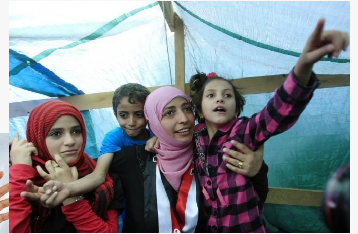
Tevekkül Kerman Nobel Peace Prize - 2011