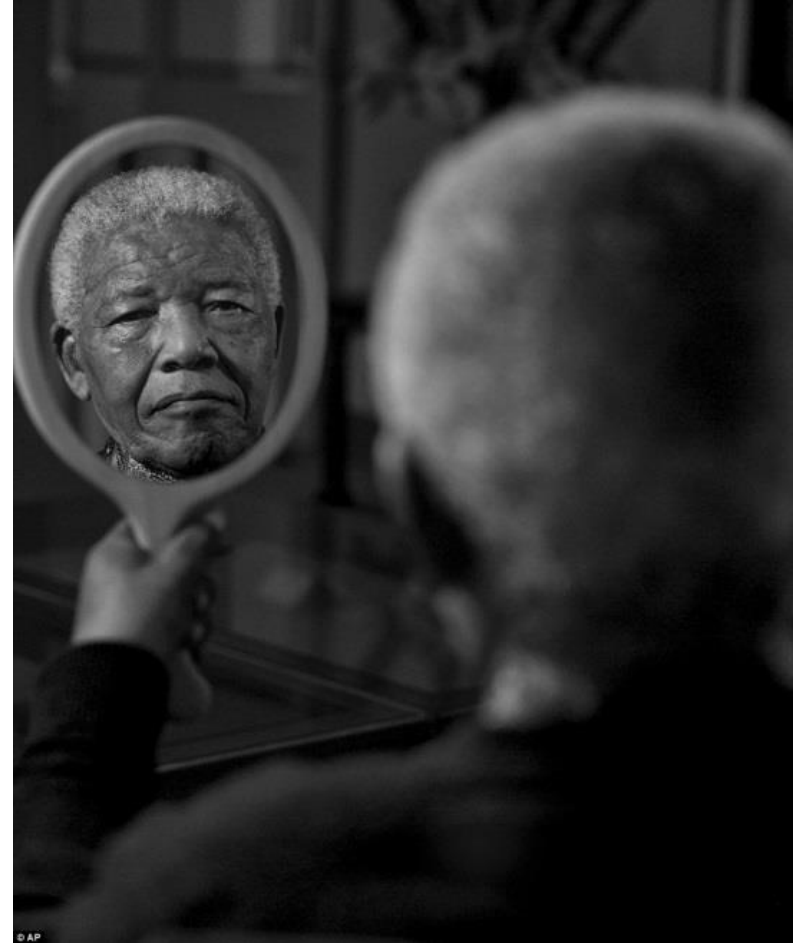
Taking a look and being aware